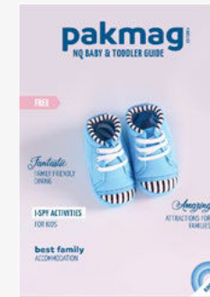
PakMag Baby & Toddler Guide