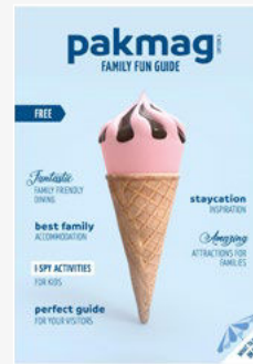
PakMag Family Fun Guide