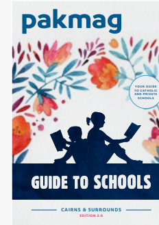
PakMag Guide to Schools